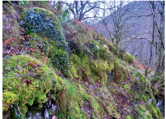
▼ Llyfnant Valley, Cardiganshire, 2014. Des Callaghan

Dioicous; male plants common; female plants are rare; sporophytes unknown. Bulbils rather rare.