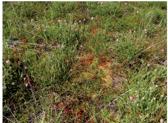
▼ Dersingham Bog, West Norfolk, 2014. Robin Stevenson

It is patchy and unpredictable in its occurrence, often in small quantity and easily overlooked. Compact forms of S. subnitens can be deceptively similar and the map probably contains a few erroneous records that were not checked microscopically.