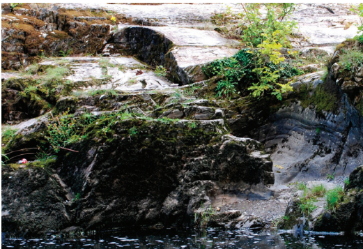
◀ Afon Teifi, Cenarth, Cardiganshire, 2007.