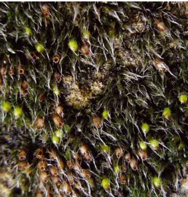
▲ Fig. 3. Piece of sandstone with a rich patch of G. crinita vegetation, collected in May 2010 in Caspe, Spain (top) and production of young sporophytes in September 2010 (bottom). H.C. Grevén

importantly it is too dry for competitors such as Bryum and Ceratodon species and algae. As the required habitat is present in large amounts, the species can settle on various boulders, allowing continuous growth. From my research, I conclude that in Britain and in The Netherlands G. crinita may occasionally settle and grow on old, mortar-covered walls and roofs. However, after a few years the plants disappear, usually before they have been detected by bryologists. In May 2010, a piece of sandstone with a rich growth of G. crinita was transported from Caspe to Doorn. The transplant was placed on a south-facing garden bench. After a very humid August, young sporophytes were produced in September (Fig. 3). At the same time, I revisited the original locality in Spain, but there I was not able to detect young sporophytes. So it seems that a humid summer can accelerate the production of sporophytes by 4–5 months.