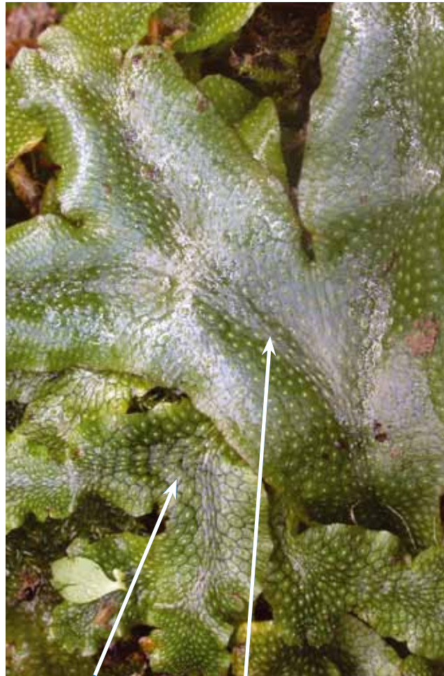
△ Conocephalum salebrosum and C. conicum.

decision making. Canadian Journal of Anesthesia 52(6), R1–R8.