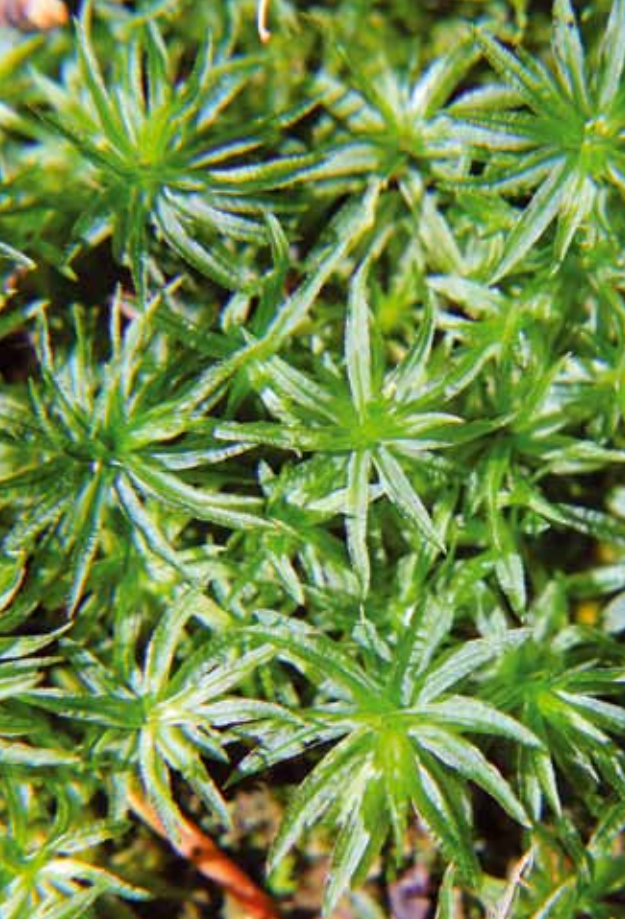
△ Atrichum undulatum

at a particularly distinctive plant, say Atrichum undulatum , the name springs into our head instantly.