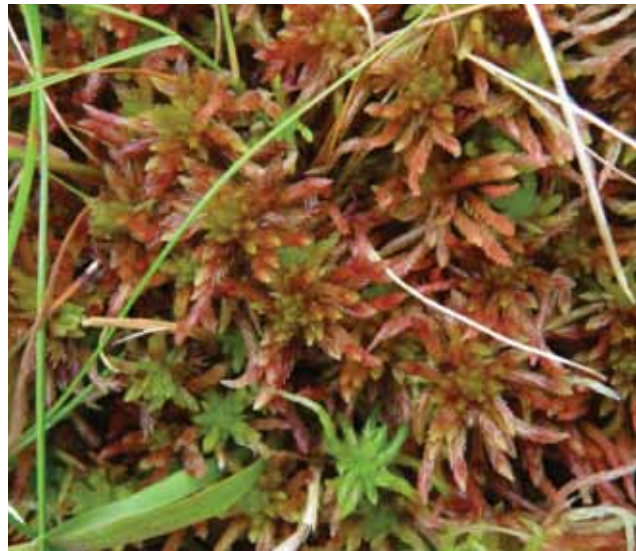
△ Sphagnum skyense from Lough Curra, Galtee Mountains, Co. Tipperary (v.-c. H7). Jo Denyer

1.16. Sphagnum skyense . 102 : in Calluna heath with Adelanthus lindbergianus , 445 m alt., north-east side of Beinn Bheigier, NR43645605, GP Rothero 2011002, conf. MO Hill; H7 : flushed grassland/heath on north-facing