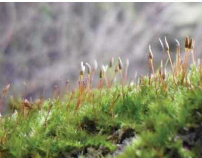
△ Pylaisia polyantha with its usual abundance of capsules, Bonsall, Derbyshire (v.-c. 57).

Ephemerella readeri is now known from a second station, in North Devon, where it was found in 2004, a long way from its Yorkshire