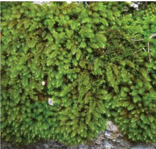
△ Leucodon sciuroides from Donadea Demesne, Co. Kildare (v.-c. H19). Jo Denyer

214.2. Isoetecium alopecuroides . H19: on trunk of sycamore, ca 105 m alt., Mooreabbey Demesne, Monasterevin, N6309, TL Blockeel 40/515, JL Denyer et al.