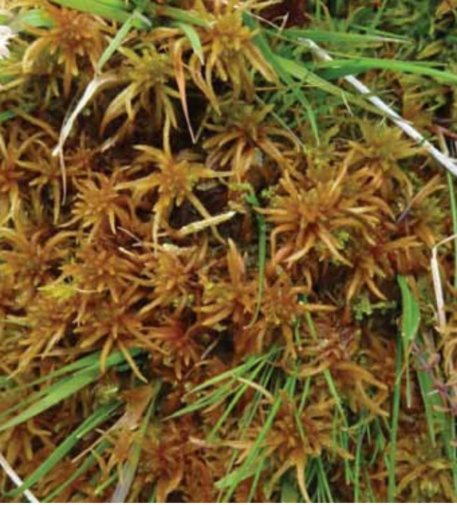
△ Sphagnum teres from Lough Muskry, Galtee Mountains, Co. Tipperary (v.-c. H7).