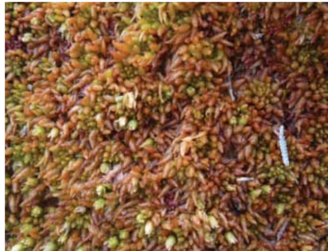
△ Sphagnum austinii from Co. Galway (v.-c. H17). Jo Denyer

1.7. Sphagnum teres . H7 : basic flush on hillside, 410 m alt., north-facing slope below Lough Muskry, Galtee