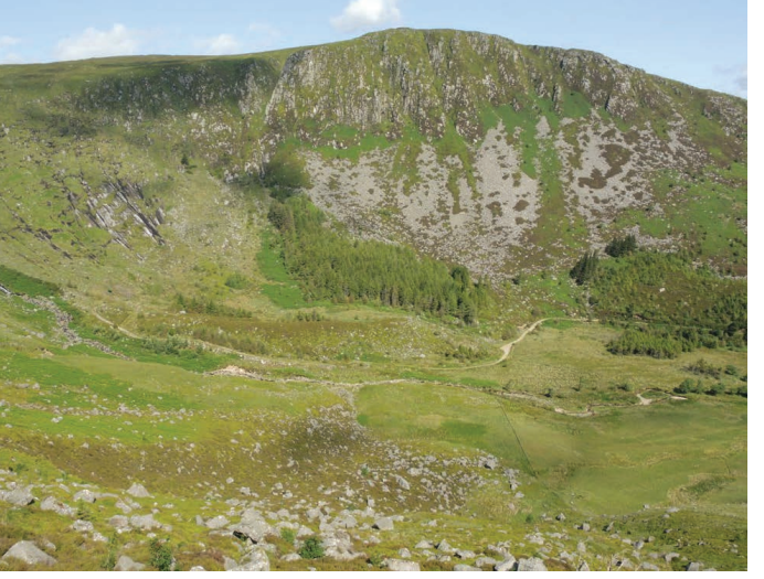
△Fig. 6. Fraughan Rock Glen, Glenmalur, Co. Wicklow, locality of Bryum riparium . R.L. Hodd