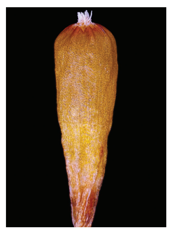
△Fig. 5. The distinctive capsule of Ulota coarctata , from Merionethshire. D.A. Callaghan