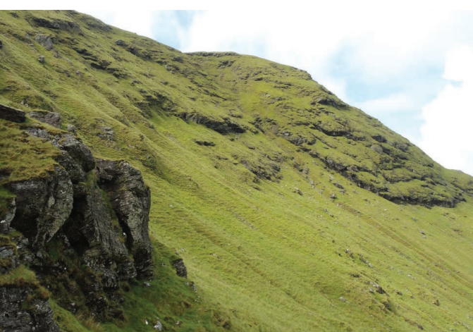
△Fig. 7. Coum Iarthar, Comeragh Mts., the site for several new vice-county records in Co. Waterford. R.L. Hodd

△Fig. 8. The northern slopes of Muckanaght, Co. Galway, location of Isopterygiopsis mulleriana . R.L. Hodd