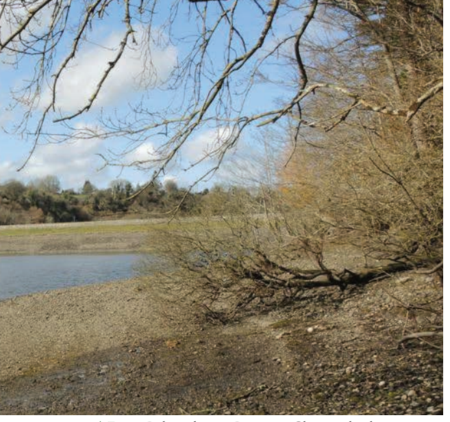
\triangle Fig. 3. Bohernabreena Reservoir, Glenasmole, the location of several new vice-county records and updates for Co. Dublin. R.L. Hodd