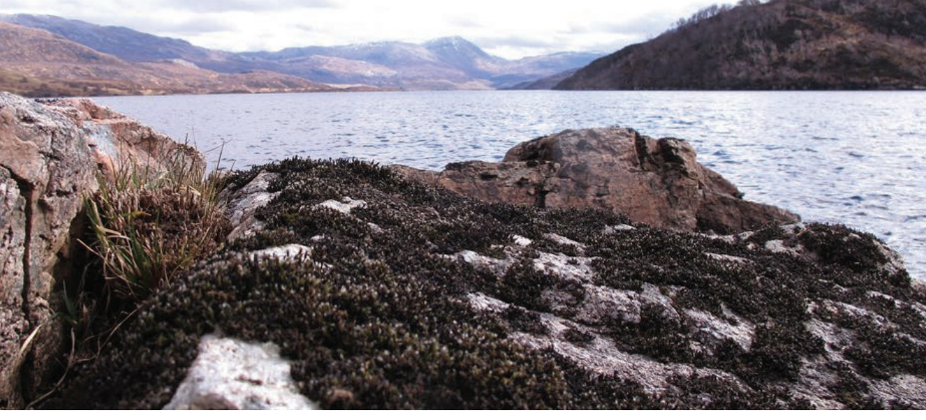
△Fig. 1. Grimmia elatior at its newly recorded site of Loch Assynt, West Sutherland.