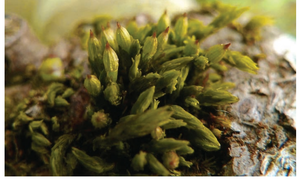
△Fig. 4. Orthotrichum pallens in East Sussex. T.W. Ottley

zone, Alnus glutinosa , River Ely, St Fagans, ST121770, 2014, G.M. Tordoff.