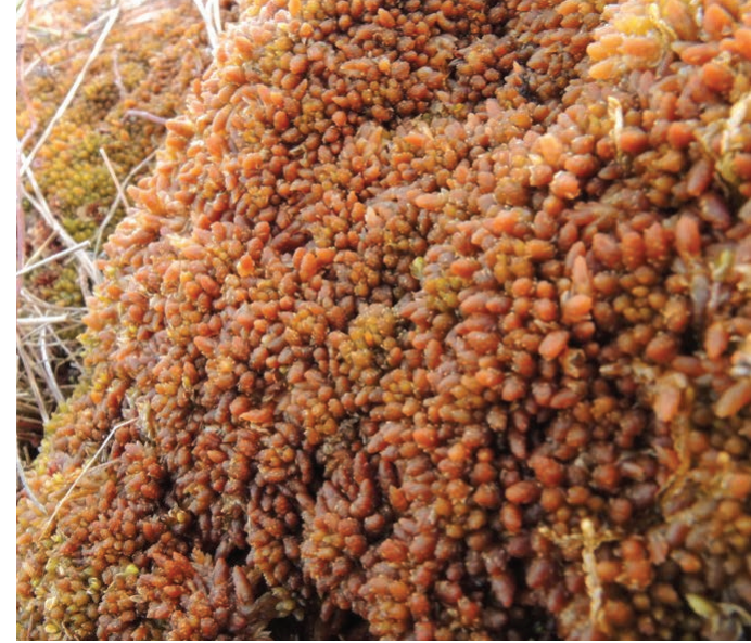
△Fig. 2. Sphagnum austinii , growing on wet blanket bog at Eshnaglogh, Co. Monaghan. R.L. Hodd

1.1. Sphagnum austinii. 103: blanket bog with S. papillosum and S. magellanicum, 30 m alt., flat area NW of Loch a'Chrotha, Coll, NM239594, 1999, A.G. Payne; H32: in wet blanket bog, Eshnaglogh, Slieve Beagh,