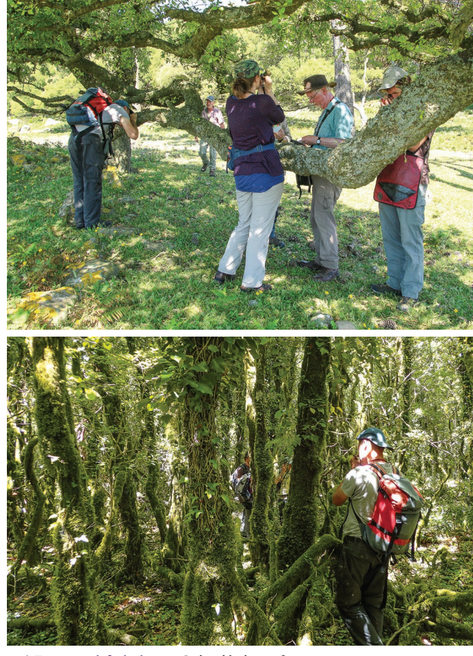
△Fig. 2, top left clockwise. Codonoblepharon forsteri. Several populations of this rare moss were found during the meeting. M. Lüth. △Fig. 3. Surveying a branch of Quercus suber at Sierra de Ojén. B. Vigalondo. △Fig. 4. Luscious epiphytic layer in a Quercus canariensis forest at Los Llanos del Juncal (Los Alcornocales Natural Park near Tarifa). Neckeraceae dominate these communities, where the fern Davallia canariensis also grows. F. Lara

A long bumping road trip led us to the southernmost part of Los Alcornocales N.P. The first stop was at Sierra de Ojén, in a windy area with great views of the Strait of Gibraltar, where we prospected an open cork oak forest with dispersed and twisted trees (Fig. 3). Shortly after we continued into the reserve, heading to "Los Llanos del Juncal" area with the guidance of two of the N.P. rangers. In this locality grows a well