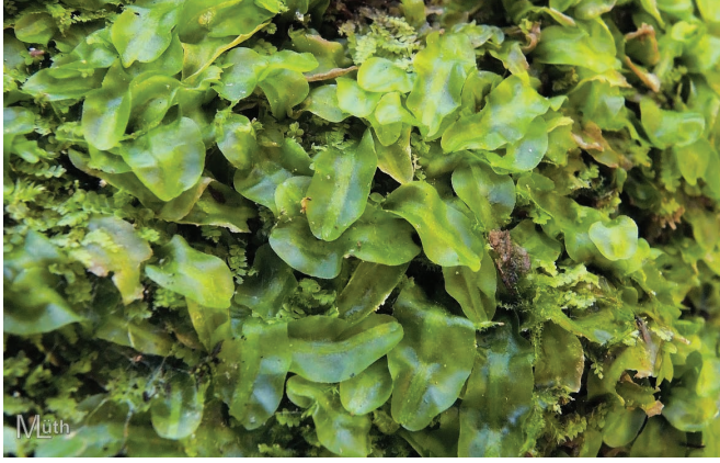
△Fig. 8. Pallavicinia lyellii. M. Lüth

in the Southern Iberian Peninsula, such as the liverworts Diplophyllum albicans, Cololejeunea minutissima, Marsupella emarginata, Lejeunea cavifolia, Frullania teneriffae, Harpalejeunea molleri, and the mosses Ulota calvescens (Fig. 6), Isothecium holtii, and Hookeria lucens. Thanks to the rangers, we could visit a small population of the rare Macaronesian-Iberian fern Culcita macrocarpa and we found some interesting bryophytes such as the previously unrecorded Telaranea europaea.