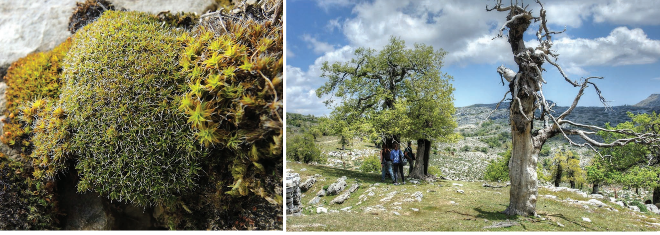
△Figs. 18, left. Syntrichia handelii between S. ruralis and Orthotrichum bistratosum in the back, on the rocks of the Spanish fir forest of Sierra de las Nieves. Fig. 19, right. Open oak formation of Quercus alpestris, an endemic and endangered tree from Sierra de las Nieves.

communities and prospects for the restoration of contaminated soils.