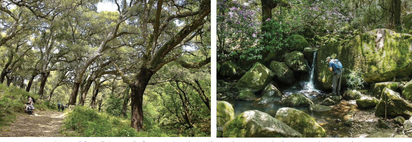
△Fig. 12, left. A tall Quercus suber forest at La Sauceda, Los Alcornocales N.P. B. Vigalondo. Fig. 13, right. La Sauceda, Los Alcornocales N.P., stream with autochthonous Rhododendron . Tom Blockeel discovering Homalia lusitanica . M. Lüth

path to the Aljibe peak surveying the stream uphill to reach an interesting area of "Canuto" vegetation formations, dominated by natural and autochthonous Rhododendron ponticum that welcomed us at lunchtime with a beautiful pink blossom (Fig. 13). Along the way up, we could examine a good population of Asterella africana, a thallose liverwort not previously known from Southern Iberian Peninsula. Other remarkable species located were the hornworts Phymatoceros bulbiculosus and Phaeoceros laevis, the liverwort Corsinia coriandrina (Fig. 14), and the mosses Dialytrichia mucronata, Fabronia pusilla, Homalia lusitanica, Orthotrichum comosum, Scorpiurium sendtneri and Tortula freibergii.