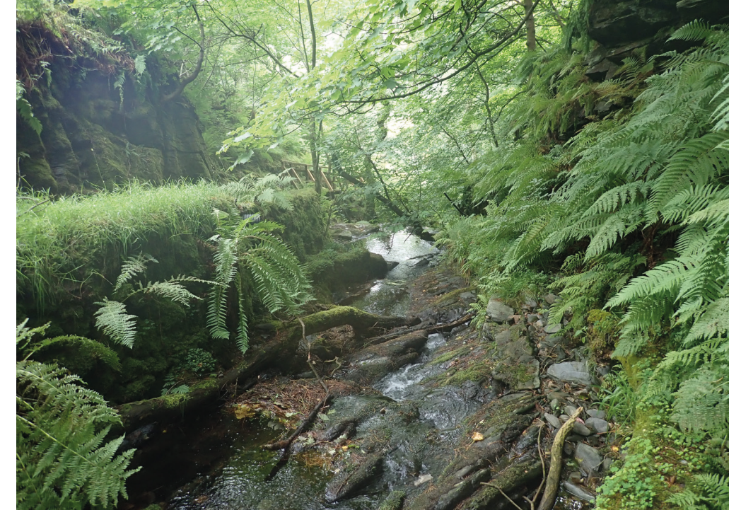
△Fig. 12. Tholt-y-Will Glen.