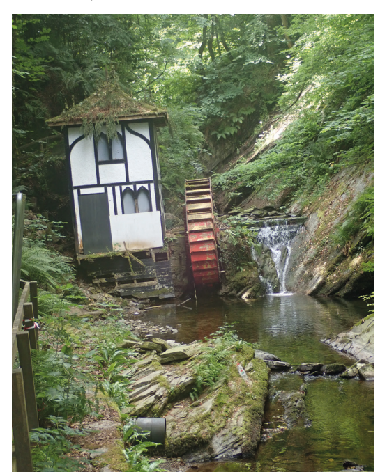
∇Fig. 8. Groudle Glen, with the waterwheel 'Little Isabella', first built in 1893.

limestone area of the island (Fig. 10), recording the monads north and south of the bridge at Rushen Abbey (SC2770, 2771) and taking refuge at lunchtime in the Abbey Restaurant where (to our slight surprise) we found that wet and scruffy bryologists were warmly welcomed. The limited area of limestone around Rushen Abbey has been well worked in the past and the 73 taxa we recorded included no additions to the island list. We did refind Cirriphyllum crassinervium and Hygroamblystegium tenax, which grow here at their only known sites on the island, though we failed despite much searching to relocate the similarly restricted Anomodon viticulosus. Hygroamblystegium fluviatile and Plagiomnium rostratum, not previously recorded here, were known from one other site on the island. Similarly our record of Hygrohypnum luridum constitutes only the second accepted site, although in this case an earlier record from near Rushen Abbey, made by Holt but treated as doubtful by Paton, should perhaps now be reinstated. It was good to see Oxystegus tenuirostris var. holtii here on Holt's