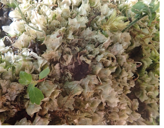
△Fig. 6. Bleached Hookeria lucens at Ballaugh Curragh.

S. irrigua, Solenostoma gracillimum and Sphagnum cuspidatum. Victoria, spending the day with the BSBI party, found a fine patch of Trichocolea tomentella, which eluded the bryological party. At the end of the day we had time to stop at the small stony bay of Port Grenaugh (SC3170), where the wet slumped cliffs had *Didymodon spadiceus as well as D. tophaceus, Fissidens incurvus and Pohlia melanodon, also plants which we were not to see again on the meeting.