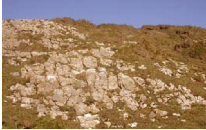
△ Upper left, Southbya tophacea ; upper right S. tophacea habitat. Lower left, Weissia levieri ; lower right, W. levieri habitat. Sam Bosanquet

and Entosthodon pulchellus . The main difference from Somerset is the absence of Cheilothela chloropus from Wales: this distinctive species has eluded searches so far, but could conceivably be present on one of the many unexplored sections of the Gower coast. None of the five species discussed above is abundant on any site, but the two RDB mosses and two RDB liverworts are represented by strong populations. Only the least threatened of the five, Bryum funckii , is present in small quantity, although it may have been somewhat overlooked.