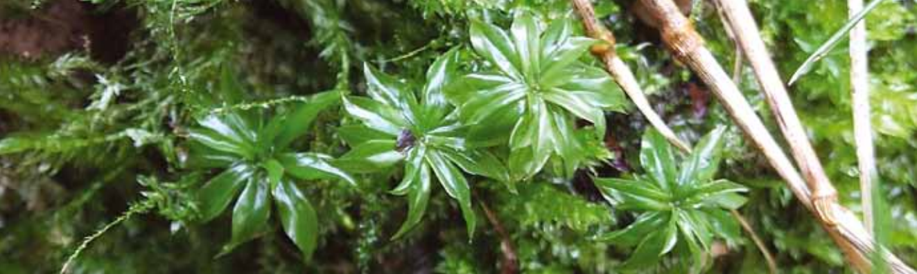
△ Rhodobryum roseum in Penwhapple burn. Ian Atherton

The other main party for the day visited the Country Park, part of the National Trust for Scotland (NTS) property at Culzean (NS2409). Here also it started wet and windy, a decidedly unpleasant combination by the sea. Within a few seconds of our arrival Physcomitrium pyriforme * surfaced at the edge of the Swan Pond car park. Coastal cliffs with ravines supported Plagiochila bifaria and Pterogonium gracile . While much of the well-wooded park was manicured, our list still contained over 100 species, including abundantly fruiting Gyroweisia tenuis on a sandstone block and Oxyrrhynchium pumilum * on a shaded ditch bank.