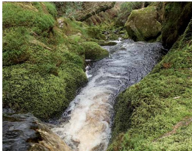
▽ Figure 5. Habitat of Nardia compressa , Cataract of the Rowan Tree, Co. Dublin. Rory Hodd