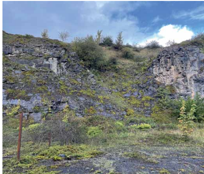
△ Figure 2. Habitat of Southbya tophacea , Castlemungret, Co. Limerick. Jo Denyer