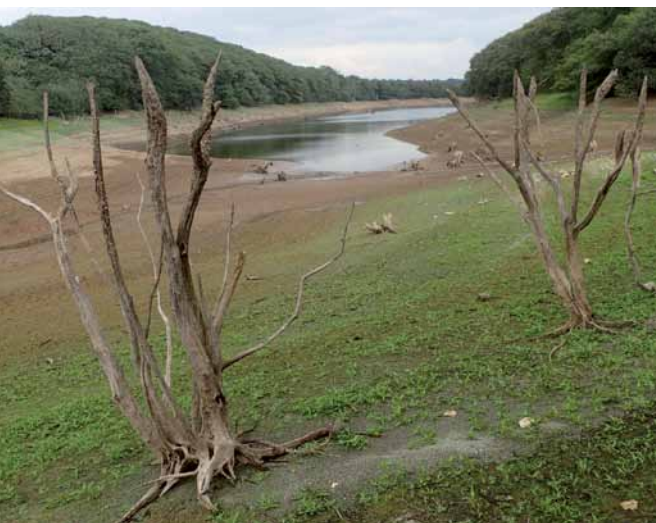
△ Figure 3. Habitat of Riccia huebeneriana, Llys-y-Frân Reservoir, Pembrokeshire.